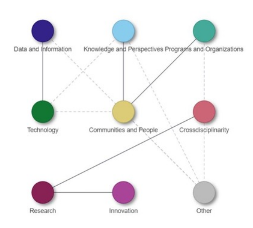
Figure 2. A network diagram demonstrating relationships between themes identified during thematic analysis. Solid lines between nodes indicate more than expected cooccurrence, whereas dotted lines indicate lower than expected cooccurrence.

We turn to the cooccur package in R to explore thematic proximity, or whether two themes tend to occur together more frequently than expected, assuming as our null hypothesis that every theme is equally likely to cooccur with every other theme. Cooccurrence between themes is visualized as a network in Figure 2, with those relationships that meet or pass a conventional threshold for statistical significance (p<0.05) detailed in Table 3. We emphasize again that quantitative exploration of relationships between themes is conducted to complement and challenge qualitative observations, rather than to suggest 'truth' or objectivity.